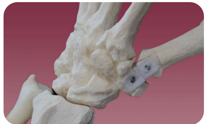
Fixation using 2.0mm screws

7098 xM Copyright ©2007 Small Bone Innovations, Inc. All rights reserved.