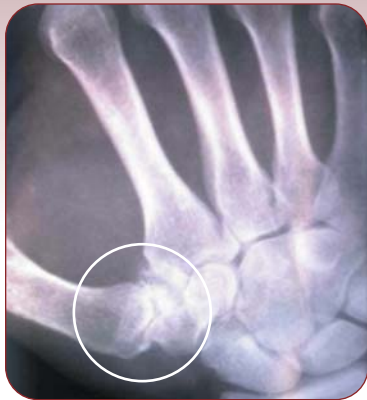
Pre-Op (Eaton-Late Stage III) Demonstrates lack of joint space with subluxation