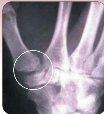
Post-Op (4 weeks) Note improved joint space and anatomic alignment of metacarpal bone